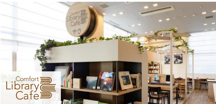
Comfort Library Cafe

Available to all guests free of charge this space offers unlimited free tea, coffee and other beverages as well as a variety of reading materials for your enjoyment, such as travel books and photo books about local culture.