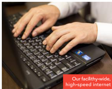
Our facility-wide, high-speed internet

All of our hotels are equipped with Wi-Fi internet access. You can connect to the Internet with a game machine by using Wi-Fi.