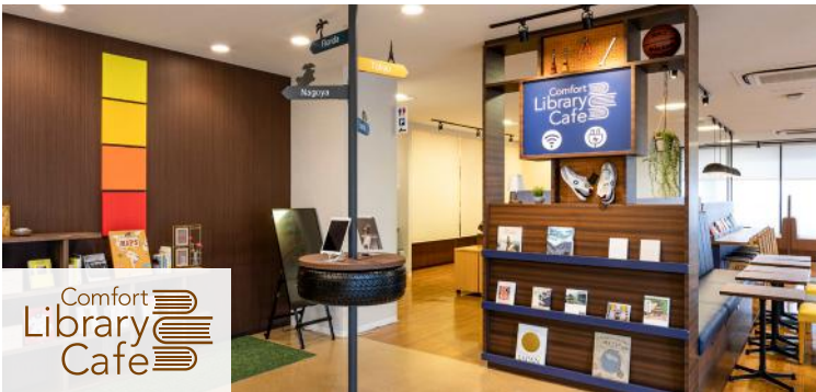
Comfort Library Cafe

Available to all guests free of charge this space offers unlimited free tea, coffee and other beverages as well as a variety of reading materials for your enjoyment, such as travel books and photo books about local culture.